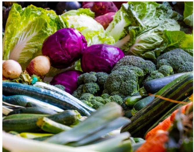
Vegetable seeds and plants available at ufseeds.com

Pennsylvania has four dominant soil orders